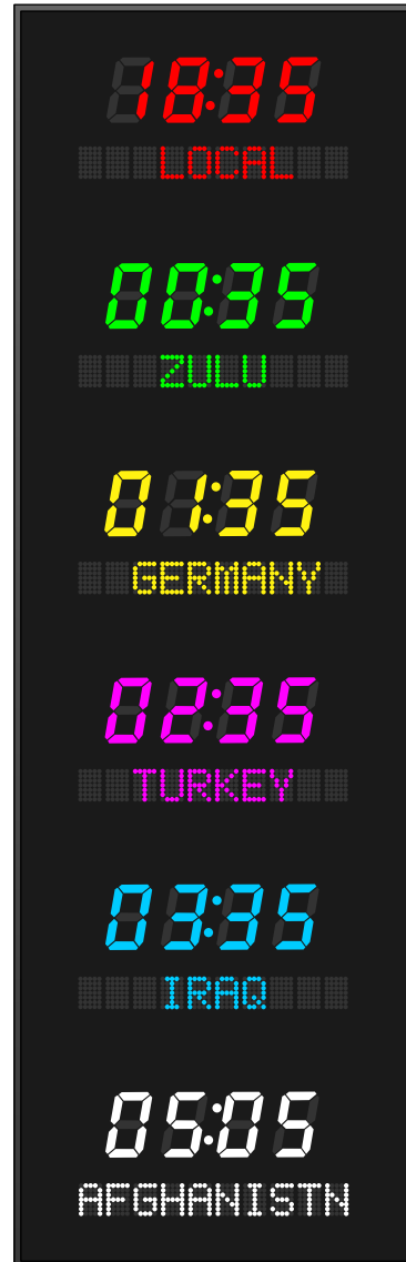
Model 3010J - 2.5" time, 1.2" zone labels, 6 zones