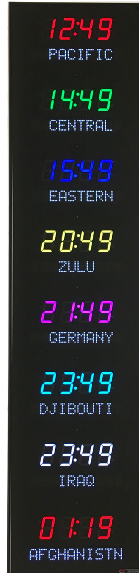
Model 3010L - 2.5" time, 1.2" zone labels, 8 zones