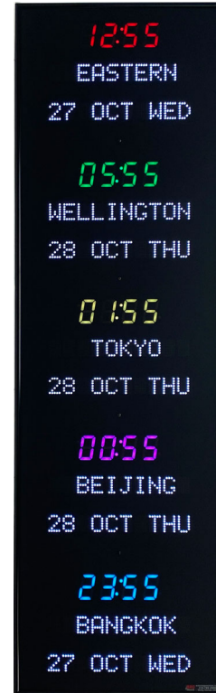
Model 3073D - 1.8" time, 1.2" zone labels, 1.2" date, 5 zones