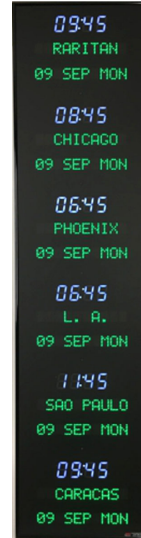
Model 3073M - 1.8" time, 1.2" zone labels, 1.2" date, 6 zones