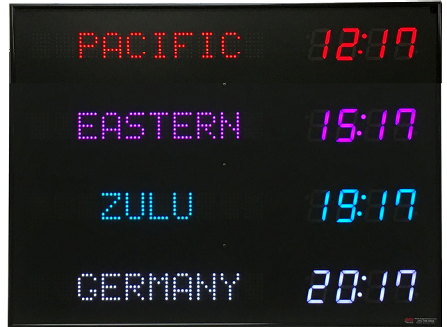
Model 3420L - 2.5" time, 2.0" zone labels, 4 zones