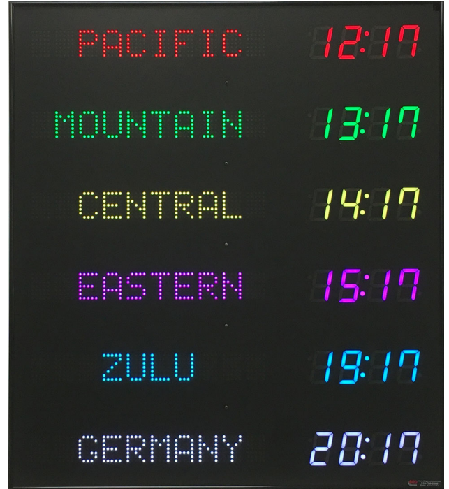
Model 3420N - 2.5" time, 2.0" zone labels, 6 zones