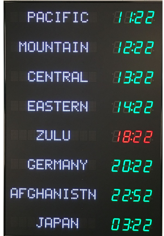
Model 3420P - 2.5" time, 2.0" zone labels, 8 zones