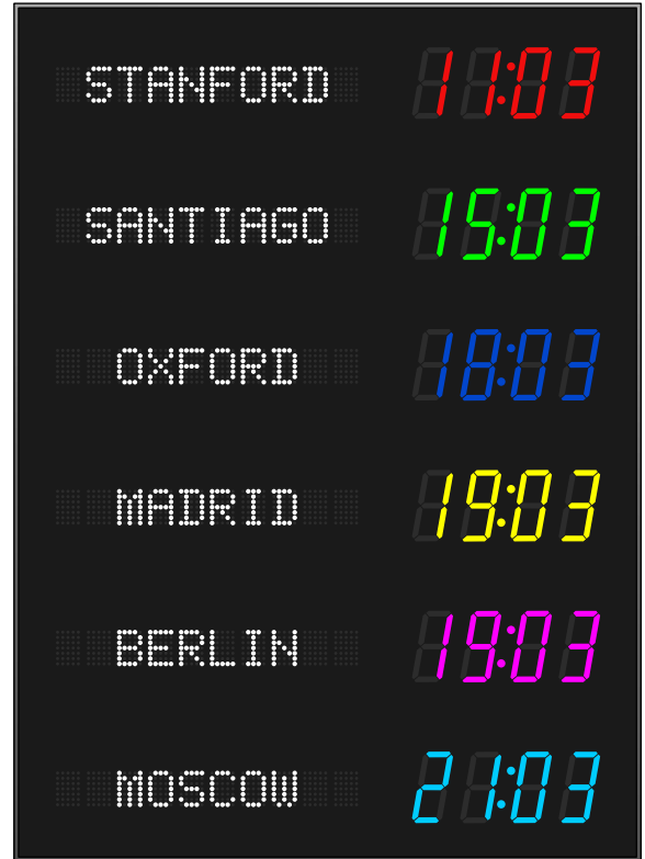
Model 3420U - 4.0" time, 2.0" zone labels, 6 zones