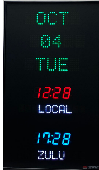
Model 3618A- 1.8" time, 1.2" zone labels, 2.0" date, 2 zones

Construction: Black anodized Aluminum frame with plexiglass front lens. Mounting hardware included.