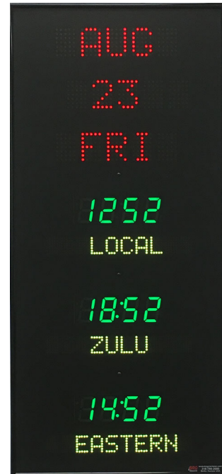
Model 3618B- 1.8" time, 1.2" zone labels, 2.0" date, 3 zones

Construction: Black anodized Aluminum frame with plexiglass front lens. Mounting hardware included.