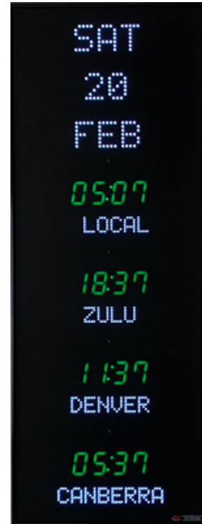
Model 3618C- 1.8" time, 1.2" zone labels, 2.0" date, 4 zones

Construction: Black anodized Aluminum frame with plexiglass front lens. Mounting hardware included.