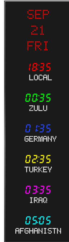
Model 3618E- 1.8" time, 1.2" zone labels, 2.0" date, 6 zones

Construction: Black anodized Aluminum frame with plexiglass front lens. Mounting hardware included.