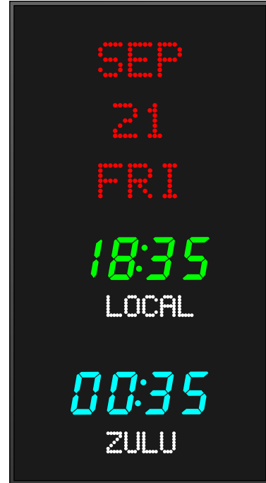
Model 3618F - 2.5" time, 1.2" zone labels, 2.0" date, 2 zones

Construction: Black anodized Aluminum frame with plexiglass front lens. Mounting hardware included.