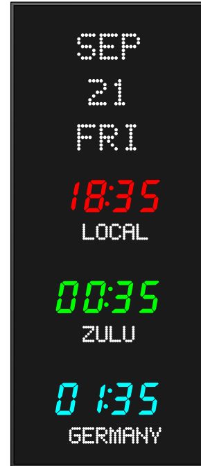
Model 361G - 2.5" time, 1.2" zone labels, 2.0" date, 3 zones

Construction: Black anodized Aluminum frame with plexiglass front lens. Mounting hardware included.