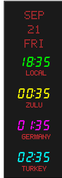
Model 361H - 2.5" time, 1.2" zone labels, 2.0" date, 4 zones

Construction: Black anodized Aluminum frame with plexiglass front lens. Mounting hardware included.