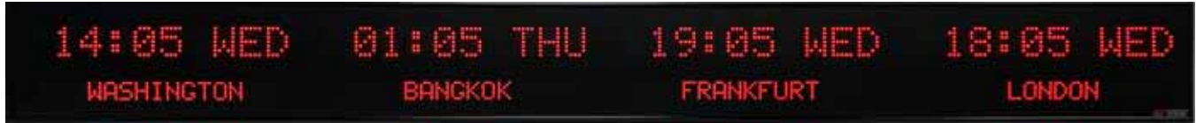
Model 5910I - 2.0" time, 1.2" zone labels, 4 zone