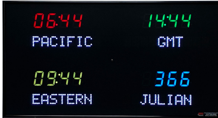
Model 6612S - 1.8" time, 1.2" zone labels, 4 zones