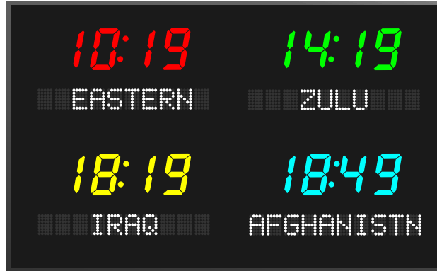
Model 6612T - 2.5" time, 1.2" zone labels, 4 zones