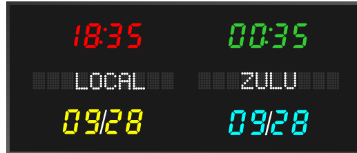
Model 6613A - 1.8" bar segment time & date, 1.2" zone labels, 2 zones