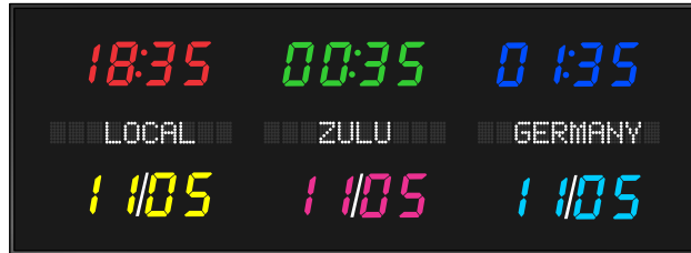
Model 6613F - 2.5" bar segment time & date, 1.2" zone labels, 3 zones