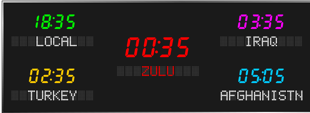
Model 6614A - 2.5" center zone time, 1.8" perimeter zone time, 1.2" zone labels, 5 zones