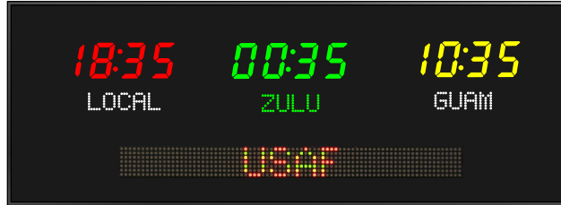
Model 6619F - 2.5" time, 1.2" zone labels, 2.0" dot matrix message display 24" wide, 3 zones