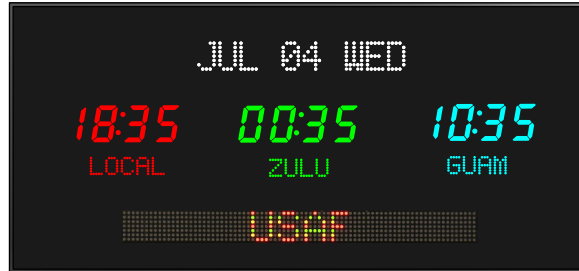
Model 6789G - 2.5" time, 2.0" zone labels, 2.0" 10 character date 2.0" dot matrix message display 24" wide, 3 zones