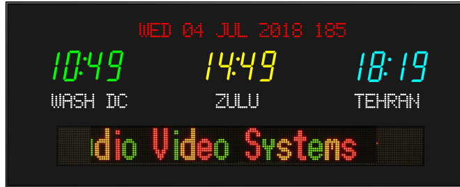
Model 6789M - 4.0" time, 2.0" zone labels, 2.0" 20 character date 4.0" dot matrix message display 48" wide, 3 zones