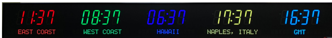
Model 7710O - 4.0" time, 15 character - 1.2" zone labels, 5 zones

The 7710 series time zone clocks feature user changeable multi-color bar-segment LEDs for the time displays and fifteen character dot matrix digital zone labels below. In many 7710 models, the clock can display up to 16 time zones through page flipping. For example, a five zone clock can show three pages of time zone information. Likewise, a three zone unit can show five pages.