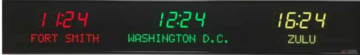
Model 7710H - 2.5" time, 15 character 1.2" zone labels & date, 3 zones