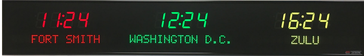
Model 7710H - 2.5" time, 15 character 1.2" zone labels & date, 3 zones