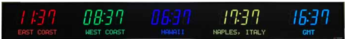
Model 7710O - 4.0" time, 15 character - 1.2" zone labels, 5 zones

The 7710 series time zone clocks feature user changeable multi-color bar-segment LEDs for the time displays and fifteen character dot matrix digital zone labels below. In many 7710 models, the clock can display up to 16 time zones through page flipping. For example, a five zone clock can show three pages of time zone information. Likewise, a three zone unit can show five pages.